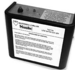
Electrical Control Unit (for remote mounting)